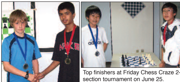
Top finishers at Friday Chess Craze 2-section tournament on June 25.

Jan. 23 (tentative) West Edmonton Mall Team Match 3